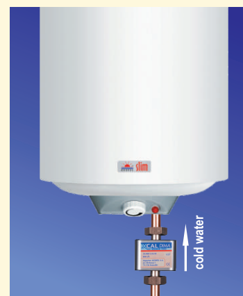
Exemplary connection of magnetic water treatment with the water supply system for electric storage water heater.